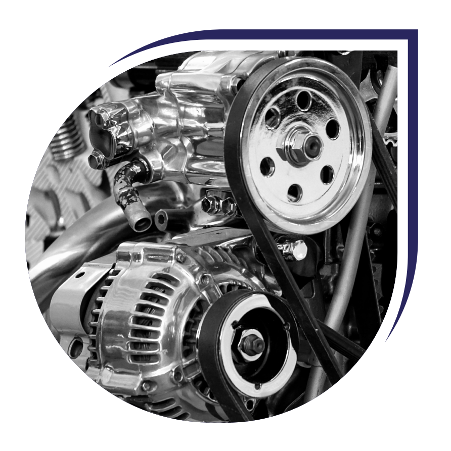
Spare Parts & Accessories